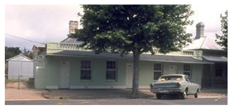
(CD Ref 1721/20)

It appears that Kollmorgen then made some alterations and additions of his own, for by 1858 this property was described as three cottages which is consistent with the present form of the property. The original bakehouse and early working-class rental housing use of the property is